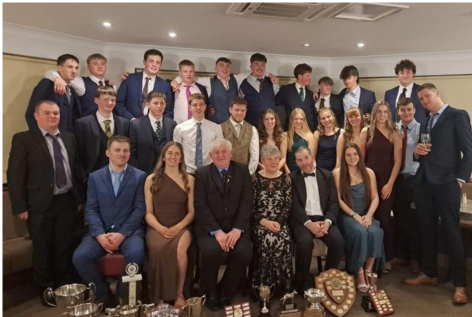
A total of £1,678.55 was raised by Callington Young Farmers following their annual dung run held last month.