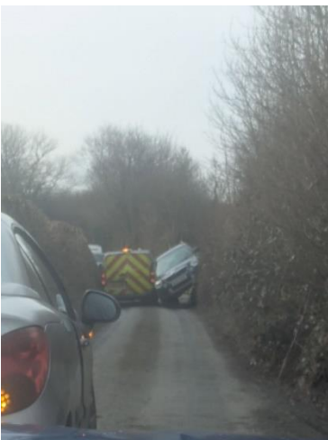
Not a passing place on Scrawsdon Hill