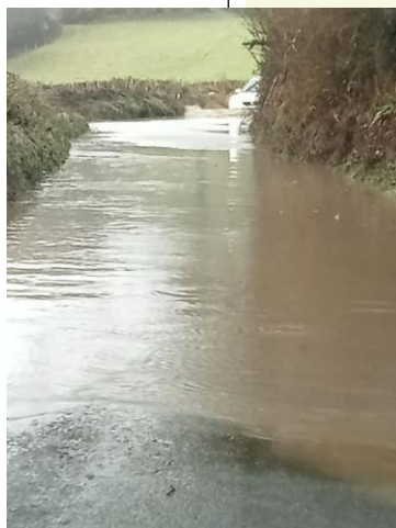
Top of Scrawsdon Hill between Burnt Wood and Mill Lawn turn